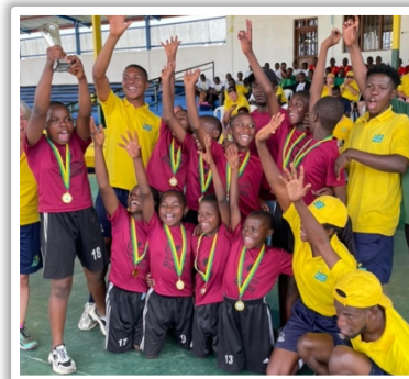
Tag tournament winners!