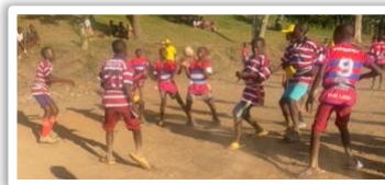
Shelford v Senghenydd!