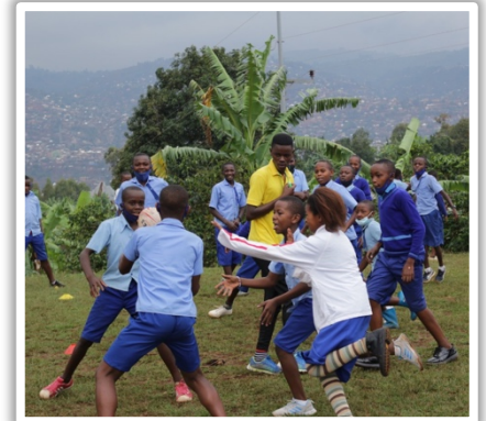
Children from ECPS primary

Donatien spent a full week with David introducing him to the schools and training him to deliver the coaching plan.