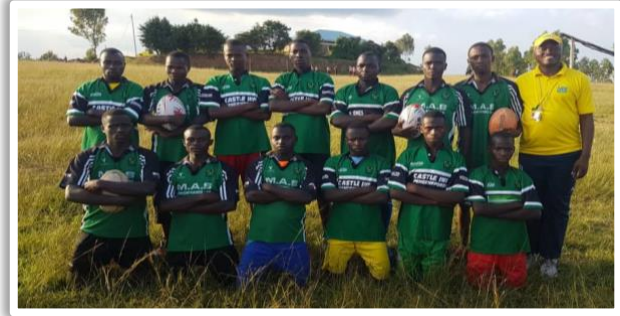
TVET Kayenzi before the Covid restrictions wearing donated kit from Gwernyfed RFC.