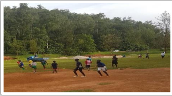
Fitness training with Gikondo Academy