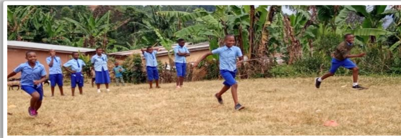
Pupils from ECPS Tara Primary enjoying relay races.

“Getting back to rugby coaching has been great and the children are very happy. We were very unlucky because we were just one week away from our tournament in March 2020 when the lockdown started.”