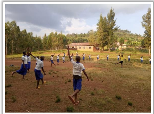
First rugby session at Nyamagana Primary school.