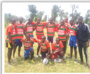
St Julians HSOB