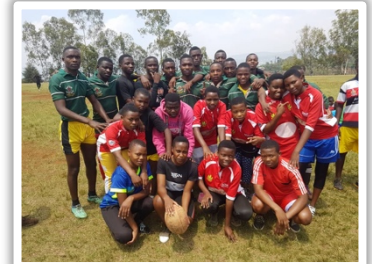
ES Bugarama teams in kits from RTB RFC and Oakdale RFC

In previous years TTC Mururu girls have proved difficult to beat but this year ES Bugarama won both the boys' and the girls' competitions.