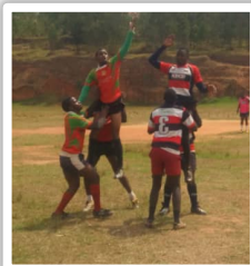
Pontypool Utd v New Tredegar