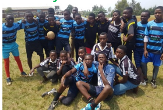
Rumney & Tumble RFC