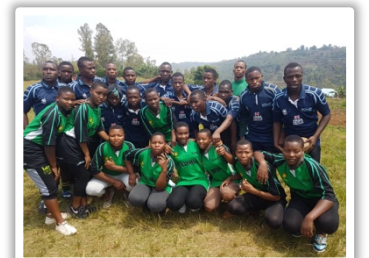
TTC Mururu teams in kits from Caldicot RFC and Caerleon RFC